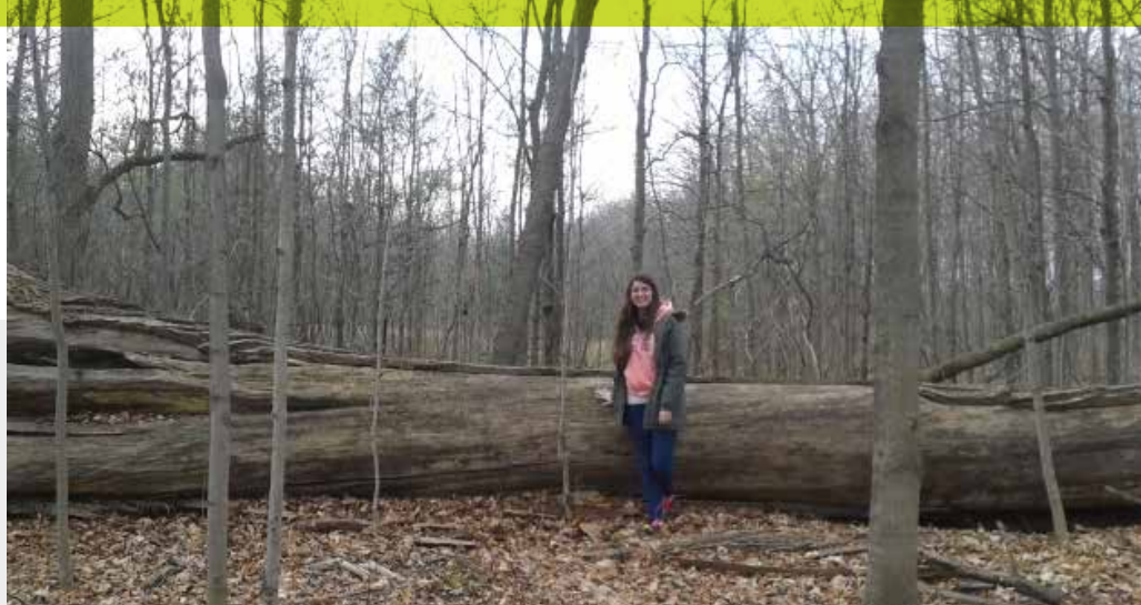
Above: Alaises in Indian Woods.

is welcoming made this period easier and pleasant! I am grateful for this experience – for what I learned, what I can apply back home, the connection to nature, and the personal growth - I will always be available to the rare Charitable Research Reserve. ■■