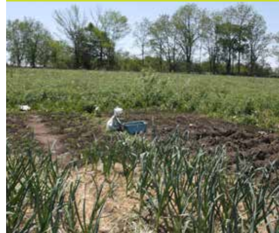
Sophie's garden plot.

Do you have a memorable nature sighting you wish to share? Tweet or Instagram using the hashtag #rareMoment or submit to rare@raresites.org with the subject line: rare Moment