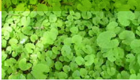
First year Garlic Mustard basal rosettes are best for pesto.