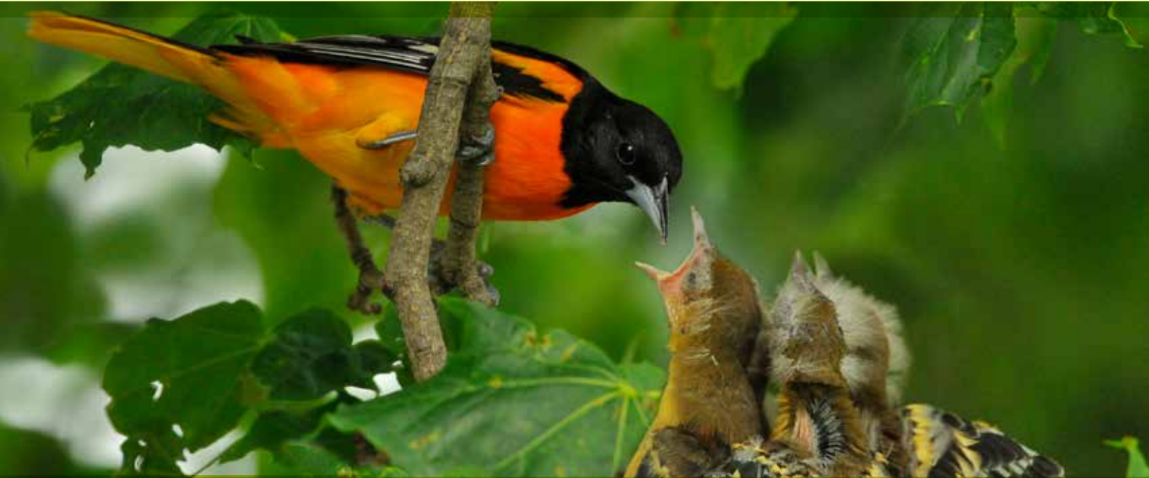
Baltimore Oriole feeding young.