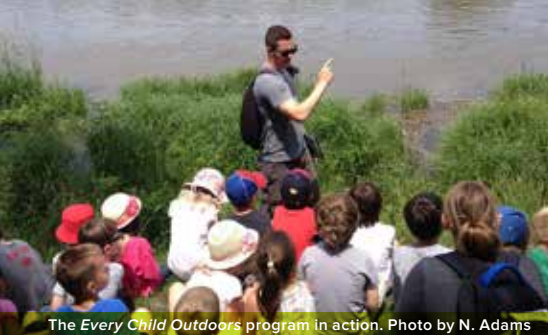
The Every Child Outdoors program in action.