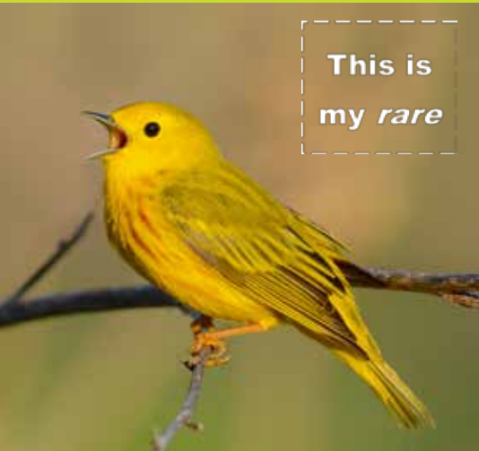
Pedro, the Yellow Warbler.