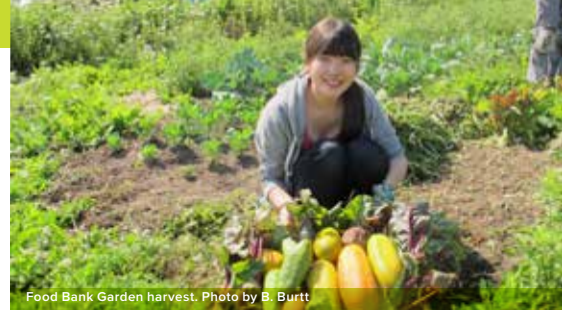
Food Bank Garden harvest.