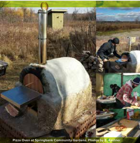
Pizza Oven at Springbank Community Gardens.

Cambridge & North Dumfries Community Foundation; International Plowing Match (1995 and 2012) Fund held at The Kitchener and Waterloo Community Foundation; Union Gas; as well as the dedicated community gardeners who donated to see this project come to fruition. Even with all that outstanding financial help it still wouldn't have been possible without the support of Weitzel Pumps & Water Treatment who worked with us to stay within our budget - a special thanks to them as well. It is going to be a great year at the gardens and it is exciting to think where the new lines will take us for years to come! ■■