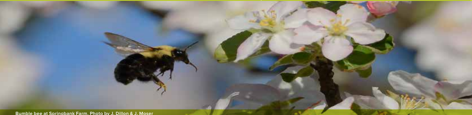
Bumble bee at Springbank Farm.