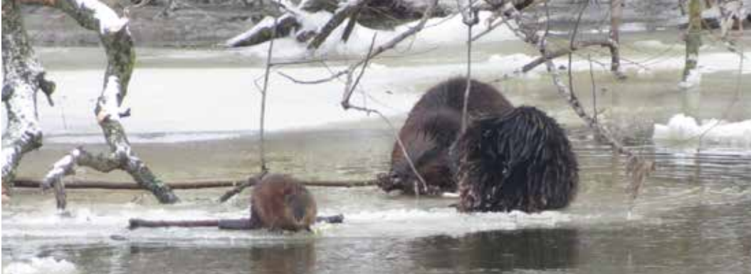
Muskrat & Beavers on rare shoreline.