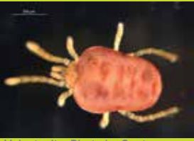
Velvet mite.

Mites (also known as Acari) belong to the class Arachnida, with close relatives such as spiders and scorpions.