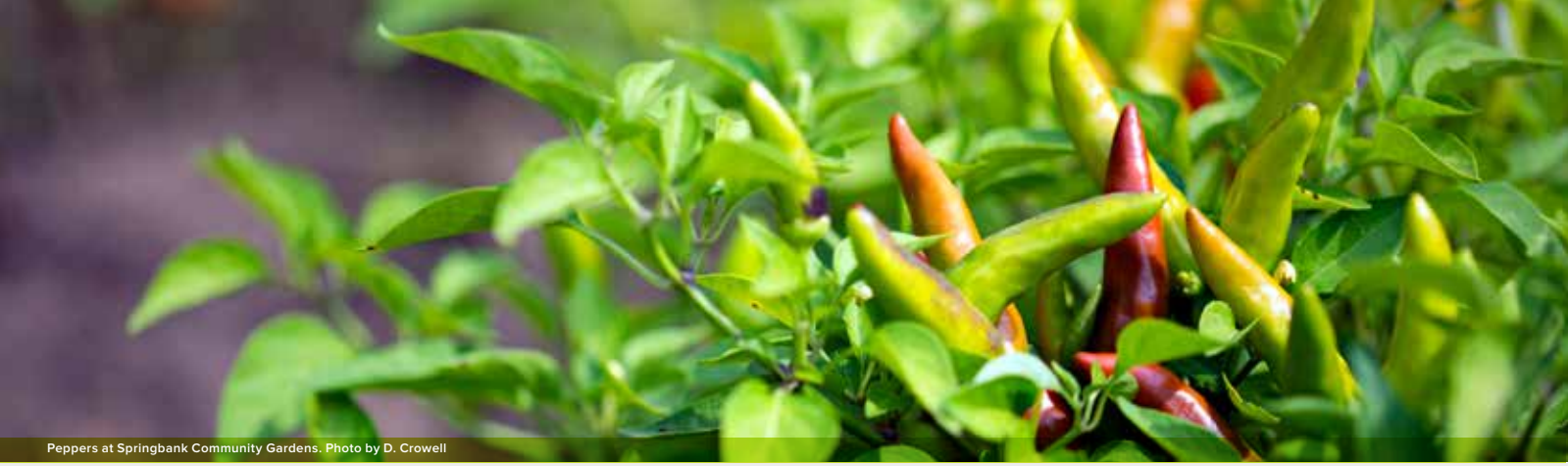
Peppers at Springbank Community Gardens.