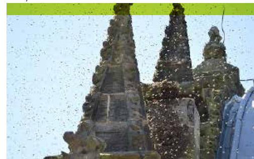
Bees causing a buzz at Rosslyn.

We had always hoped when rebuilding that one day the bees would return, and on an unusually sunny afternoon in Scotland last June, mere hours after we received news of our bee friends here at Springbank Farm, they did – and in full force!